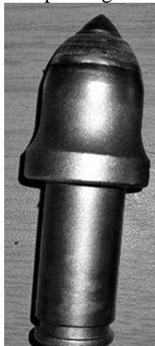
Fig.1 Picture of no-spark and anti-wear strengthen cutting pick

The non-sparking anti-abrasion strengthening pick produced by the method can achieve the hardness of 600-1500HV, the cladding layer is polished on the grinding wheel without sparks, and has excellent abrasion resistance, being 3-6 times of 35CrMnSi tooth body material . Shown in Figure 1 is the use of the production method of non-sparking anti-wear strengthening pick physical map.